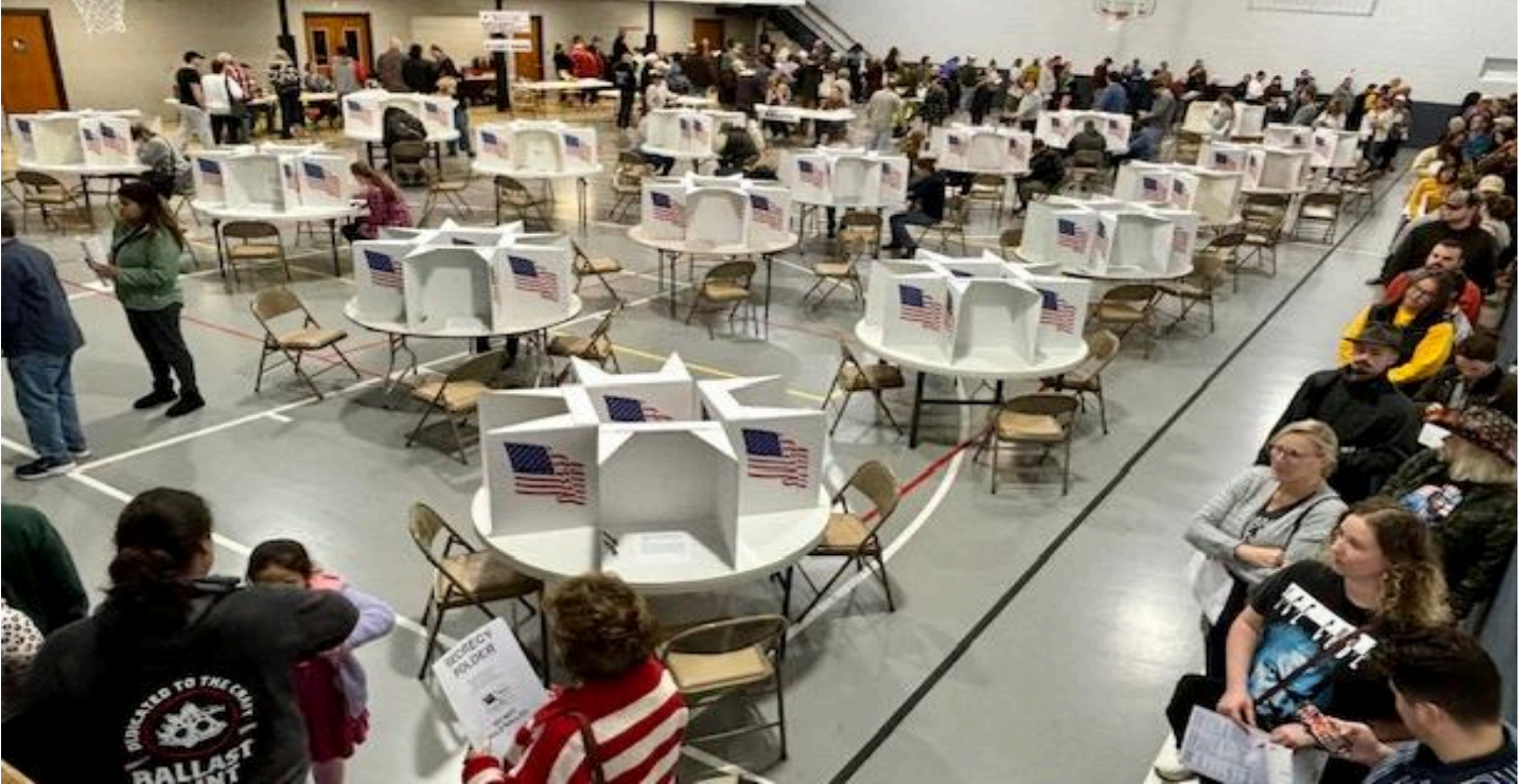
Voters wait in line to cast their ballot in Des Moines Election Day morning.